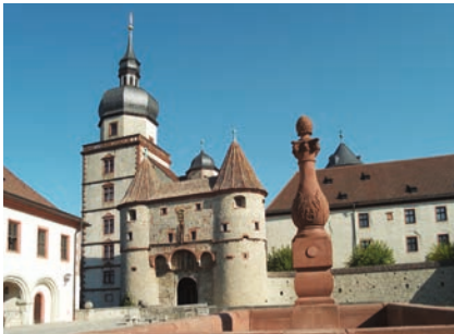
H Höchberger Tor

Würzburg is renowned for its wine. From here you can roam through the vineyards and enjoy the breathtaking view over the city .