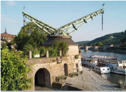
H Ulmer Hof

Hop off here to do some shopping or relax in the city centre . Or visit the impressive wineries of Würzburg: Julius-spital and Bürgerspital . The Roentgen Memorial , a museum honouring the inventor of the X-Ray, Dr Wilhelm Roentgen is within walking distance.