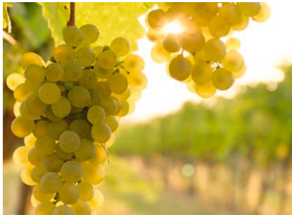
H Oberer Burgweg

It's just five minutes walk to the former State Garden Show grounds with an aquatic playpark for kids, Japanese garden and much more. Follow the footpath up to the Fortress Marienberg in just 20 minutes.