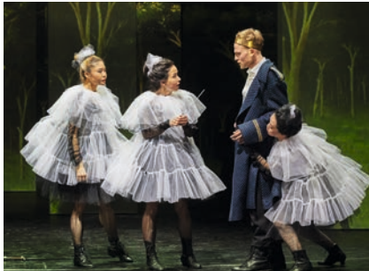
H Mainfranken Theater

Begin your journey at the famous Residence Palace , the World Heritage Site in Würzburg. Gaze in wonder at the ceiling frescoes and the Mirror Cabinet. Take some time to stroll in the elegant Court Gardens and relax on one of the many benches.